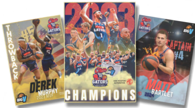
2025 Trading cards now available