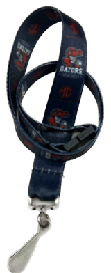
Lanyards & Keyrings