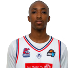
E man Training Partner