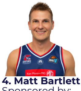
Sponsored by: The Deck