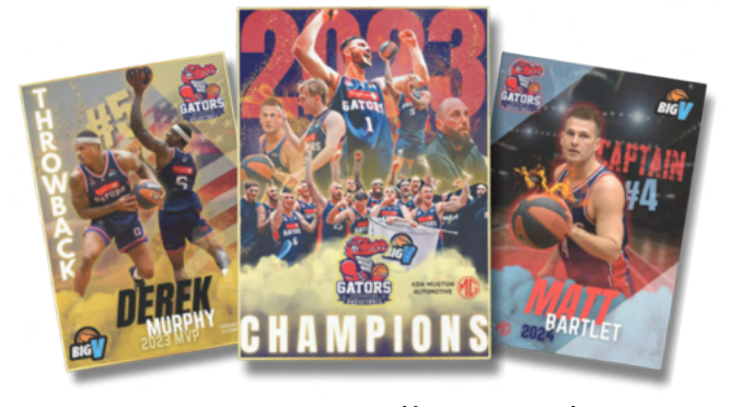
2025 Trading cards now available