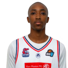
E man Training Partner

The Nelson Family and McCluskey Heating & Cooling are investing in the future of our sport by sponsoring our young developing players. Your generosity helps shape the next generation of champions!