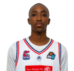
E man Training Partner

The Nelson Family and McCluskey Heating & Cooling are investing in the future of our sport by sponsoring our young developing players. Your generosity helps shape the next generation of champions!